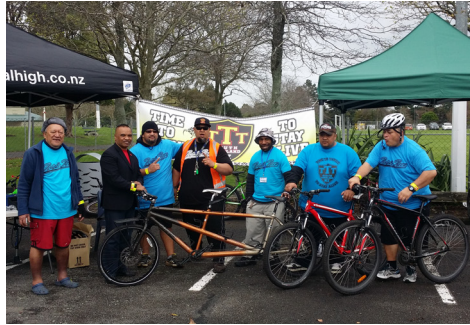
The Triple T team gearing up for the Funday event.

Tee encourages everyone from the community to come down and enjoy a free day out.