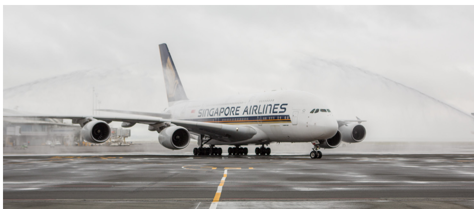
The new Singapore Airlines A380 arriving in Auckland for the first time.

Last week, for the first time, Singapore Airlines customers travelling to and from Auckland were welcomed aboard the luxury and comfort of the world's largest aircraft, the Airbus A380.