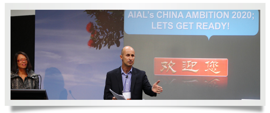
Auckland Airport launched the Tourism Fund after a series of "Let's Get Ready" China workshops with TravConsult.

Auckland Airport is calling for submissions for the new "Tourism Asia Marketing Fund" as part of its Ambition 2020 initiative.