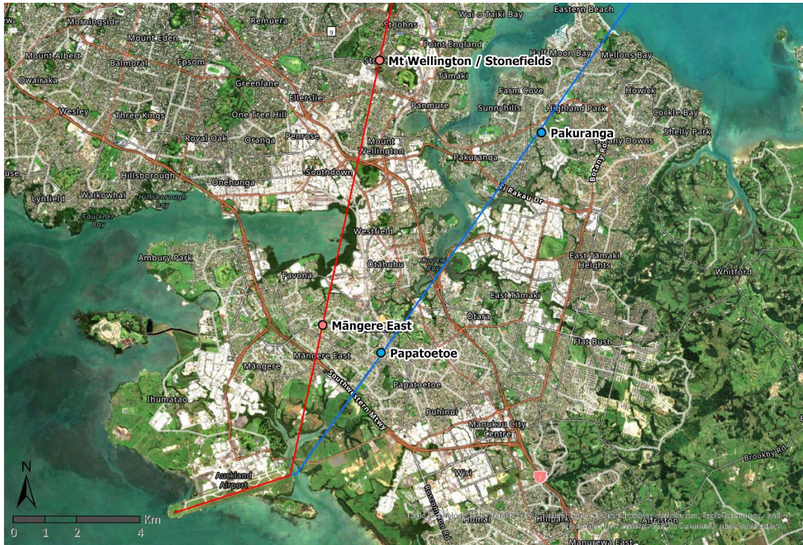
Figure 2: Proposed flightpath (in red), with current flightpath (in blue) and the calculation locations

To compare the current and proposed flightpaths, four calculations were undertaken: