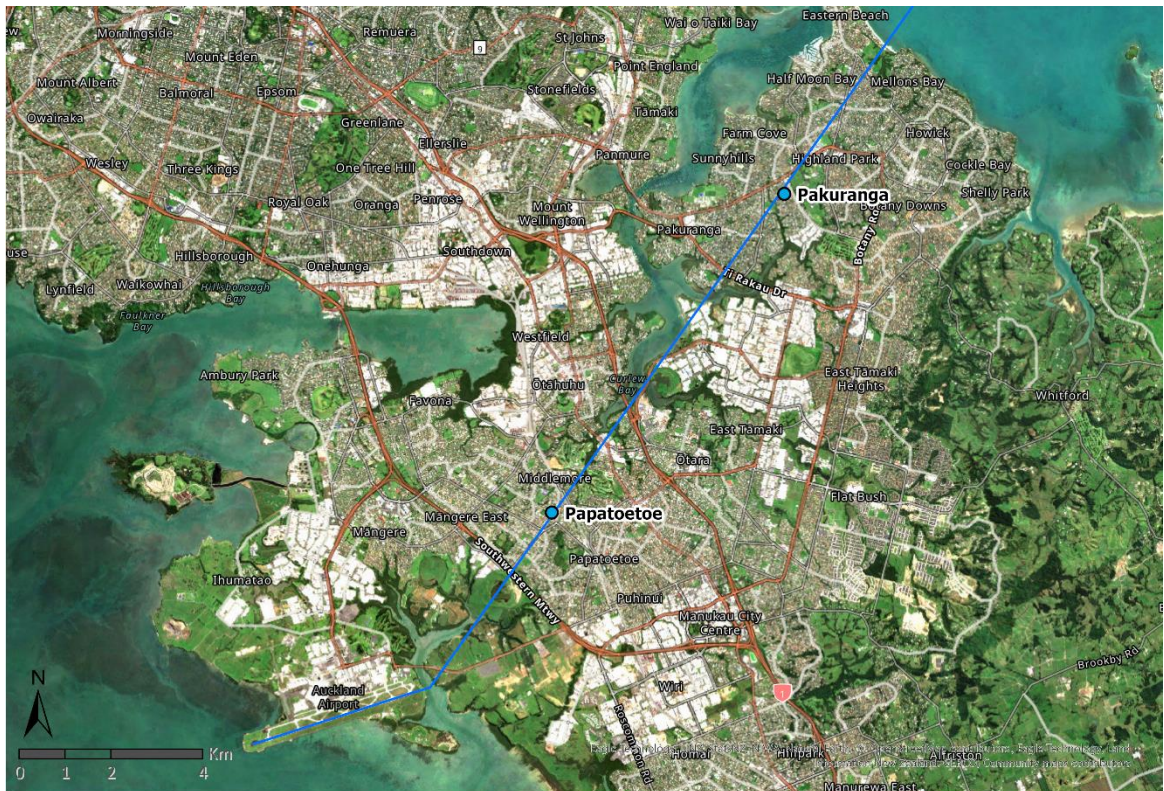
Figure 1: Map showing average domestic northbound flightpath and measurement locations

Table 2 below shows the results from the on-site measurements. These were mainly Cessna 208b flights leaving Runway 05R to Great Barrier Island (as per the flight track shown in Figure 1).